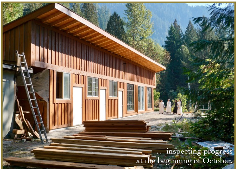
... inspecting progress at the beginning of October.