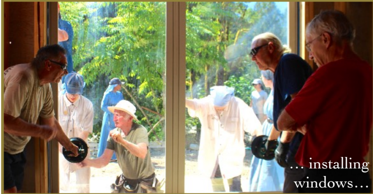
... installing windows...

From the 24th to the 29th, Pope Francis comes to Canada on a penitential pilgrimage as part of the reconciliation process between the Catholic Church and Indigenous peoples in Canada. We can follow some of the celebrations on the Internet, and are impressed by the dignity of the First Nations chiefs and peoples, the strength of their sacred song, and the noble humility of Pope Francis.