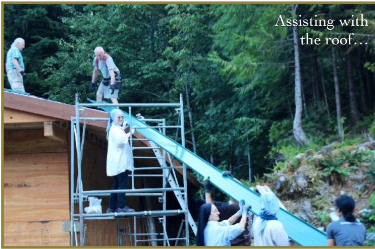
Assisting with the roof...