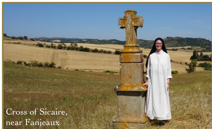
Cross of Sicaire, near Fanjeaux